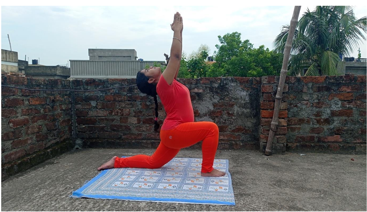
Students in Yoga sessions